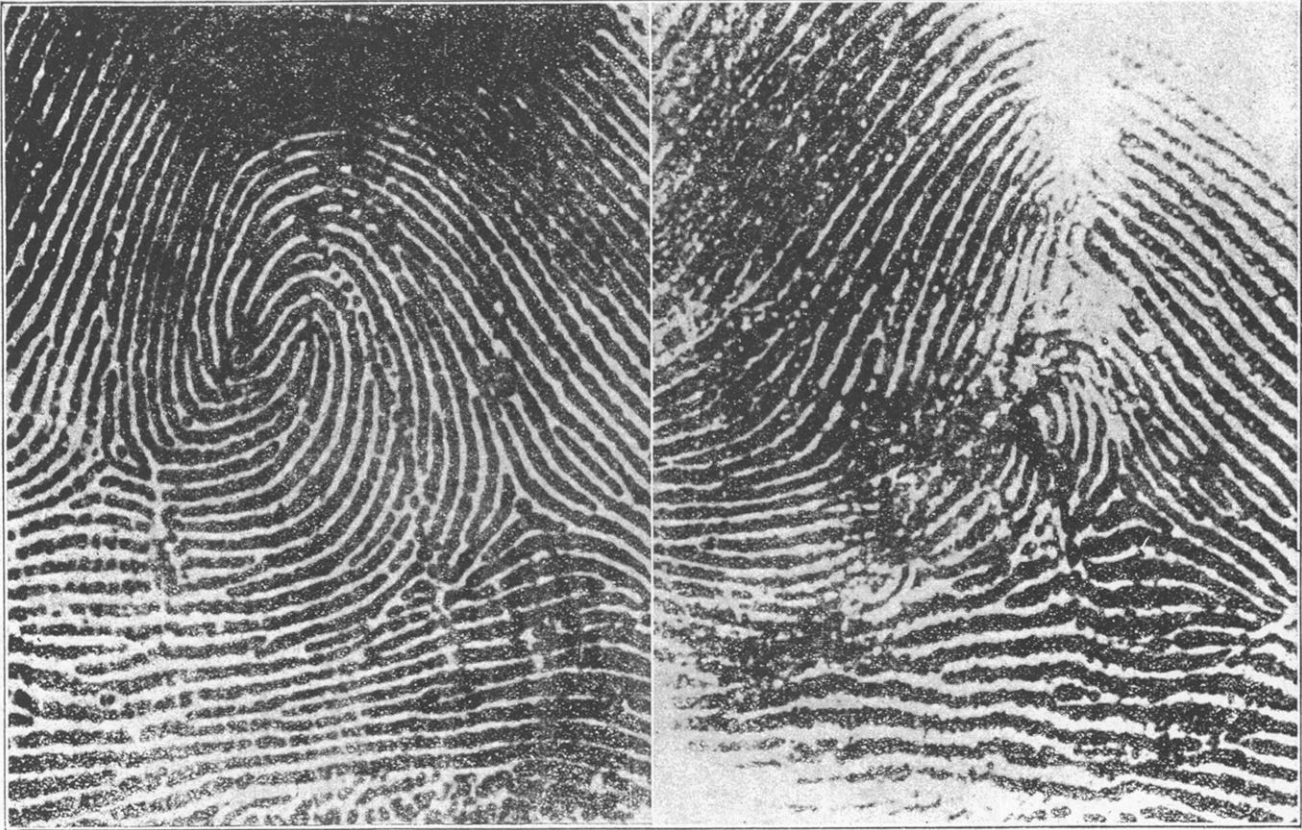
PLATE 2. Left middle finger of "Gus" Winkler, before and after mutilation (prints at the left and right, respectively).