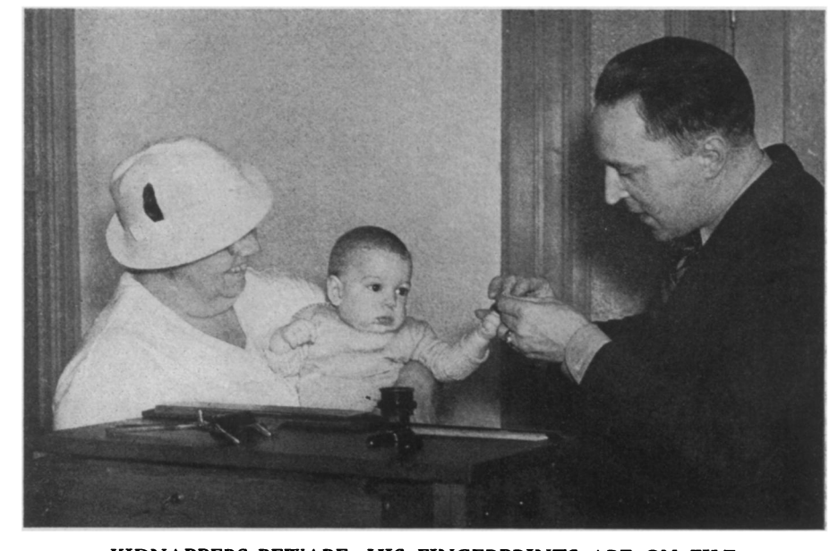
KIDNAPPERS BEWARE: HIS FINGERPRINTS ARE ON FILE This baby has kidnapping insurance in the form of fingerprints on file in the non-criminal file of the U. S. Department of Justice.

The next step is to classify the suspect's fingerprints, one by one, and search for them in the single print file, comparing each one with all those falling in that classification. Such a com-