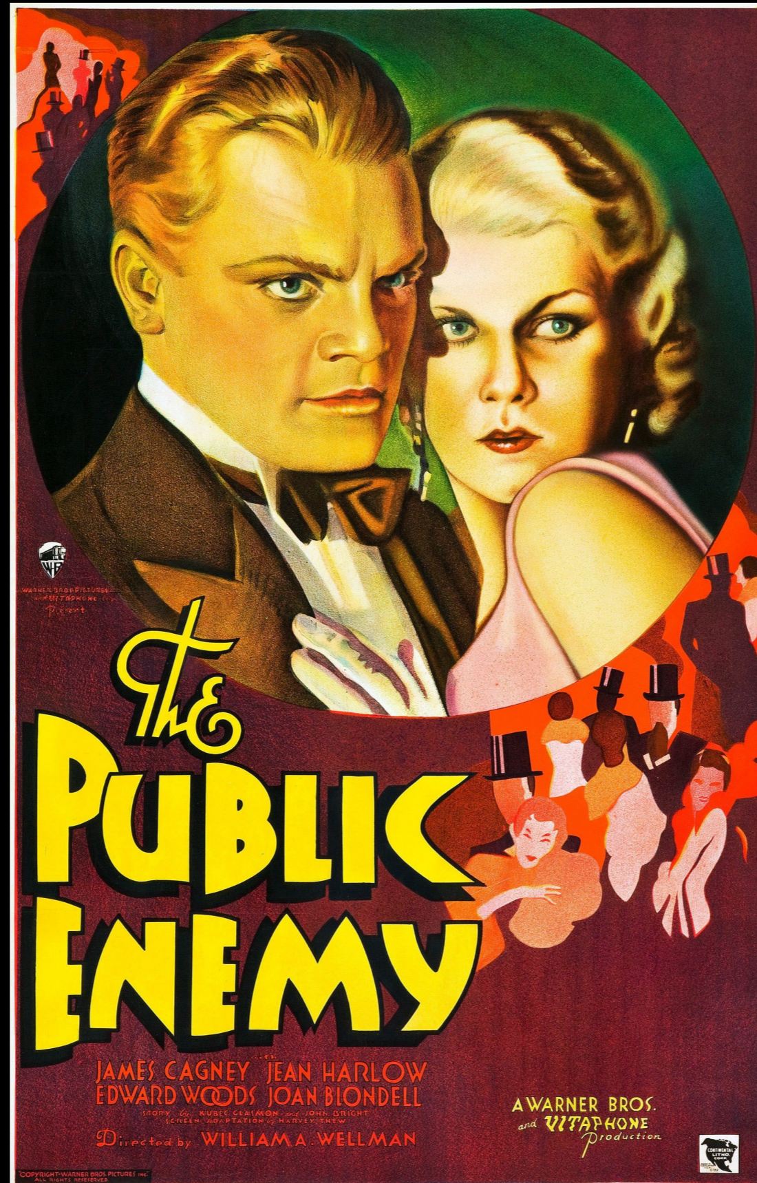
William A. Wellman, 1931