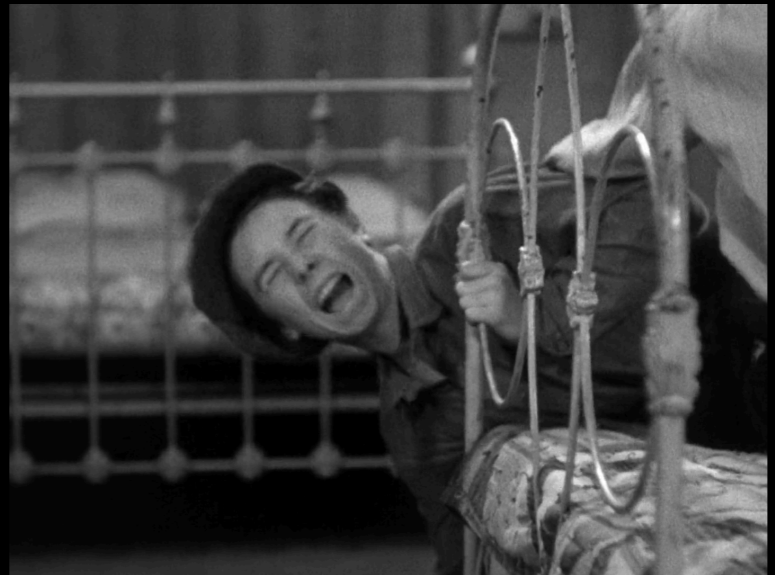
The Public Enemy (William A. Wellman, 1931)