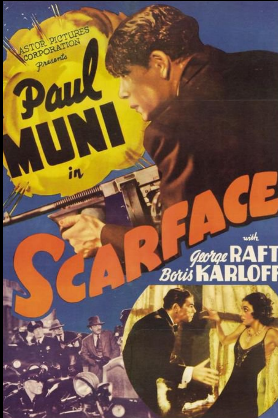
Howard Hawks, 1932 (produit par Howard Hughes)