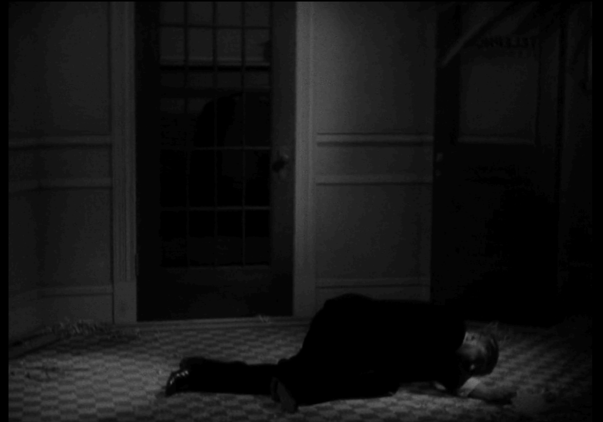
Scarface (Howard Hawks, 1932)